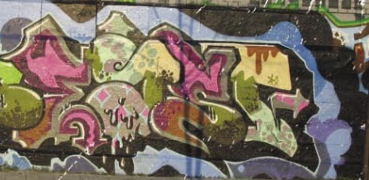
CITY BOYZ IN MUNCHEN