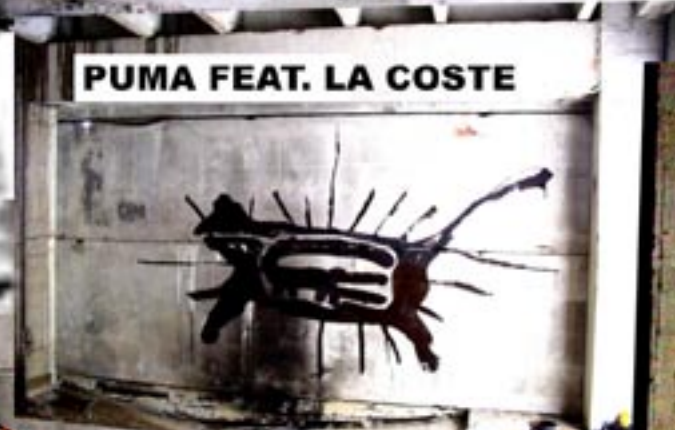
PUMA FEAT. LA COSTE